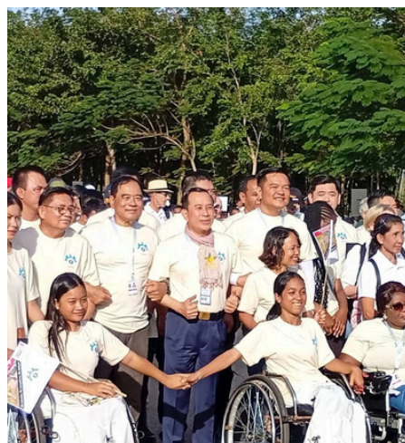
Photo: thousands participated in the walk for a mine free world at Angkor Wat in Siem Reap

The issue of completing clearance obligations under Article 5 remains a significant challenge. Even countries with relatively low levels of contamination struggle to fully meet their commitments and often need deadline extensions. Ensuring sustained support, cooperation, and resources is essential to help these states finalize their obligations and maintain the treaty's momentum toward a mine-free future.