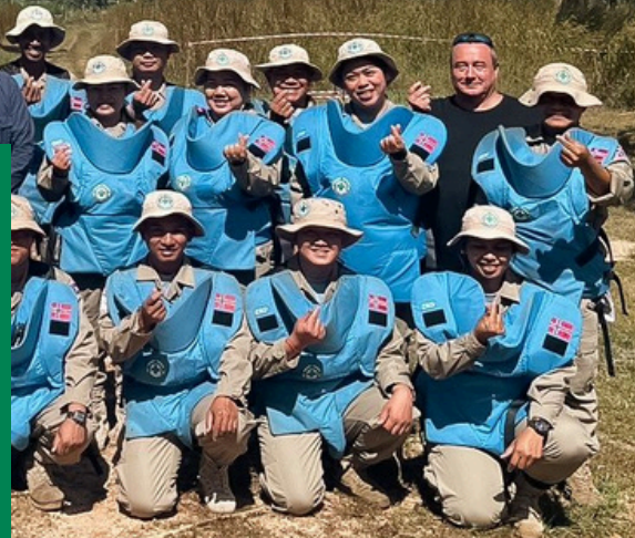
Group photo: field visit by NPA Secretary General