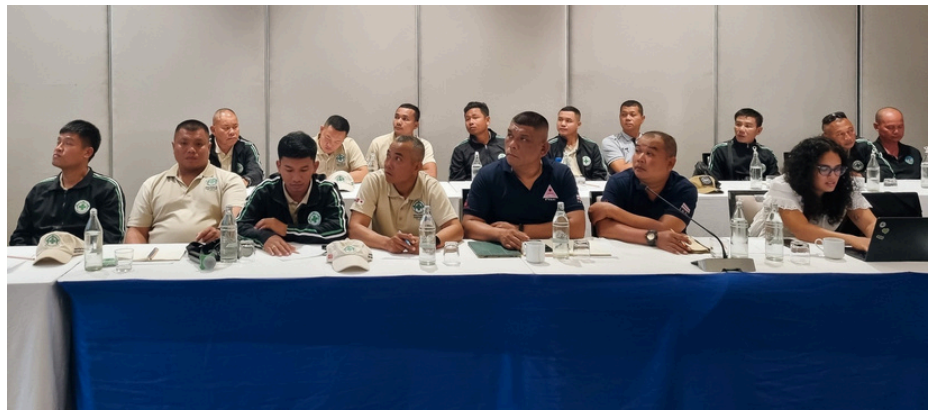
Photo: field based and Bangkok staff, including HMAU, gathered during Q4 meeting

The NPA Thailand Management Meeting (MGM) for Q4 2024 was held during the first week of December, organized by senior management with the participation of the entire NPA team, including HMAU staff for the first time this year.