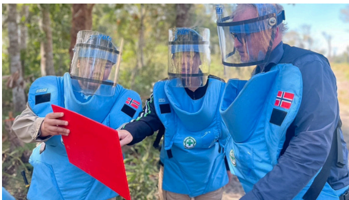
Photo: field supervisor, programme manager and SG