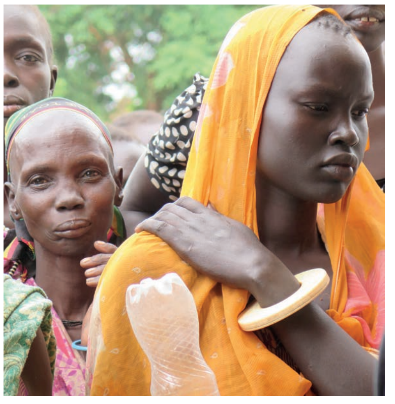
Women who fled armed conflict in South Sudan.

NPA will hold itself accountable to persons and communities concerned for our organisational decisions and the actions of our personnel. Protection and safeguarding against sexual exploitation and abuse shall also be mainstreamed and integrated into all NPA's humanitarian programming. This implies ensuring appropriate accountability mechanisms and working with the affected persons, communities and groups to support their self-protection capacities.