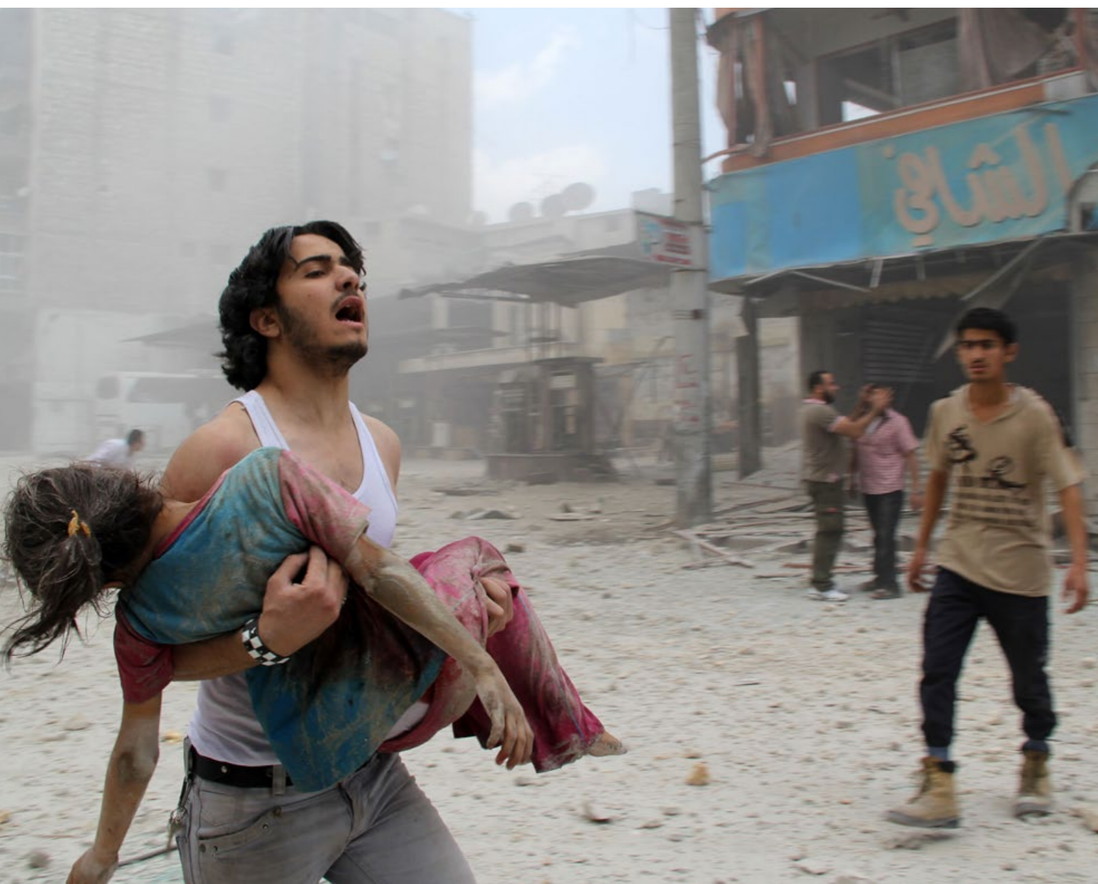
A man carries a young girl who was injured in a reported barrel-bomb attack by government forces on June 3, 2014 in Kallaseh district in the northern city of Aleppo, Syria.