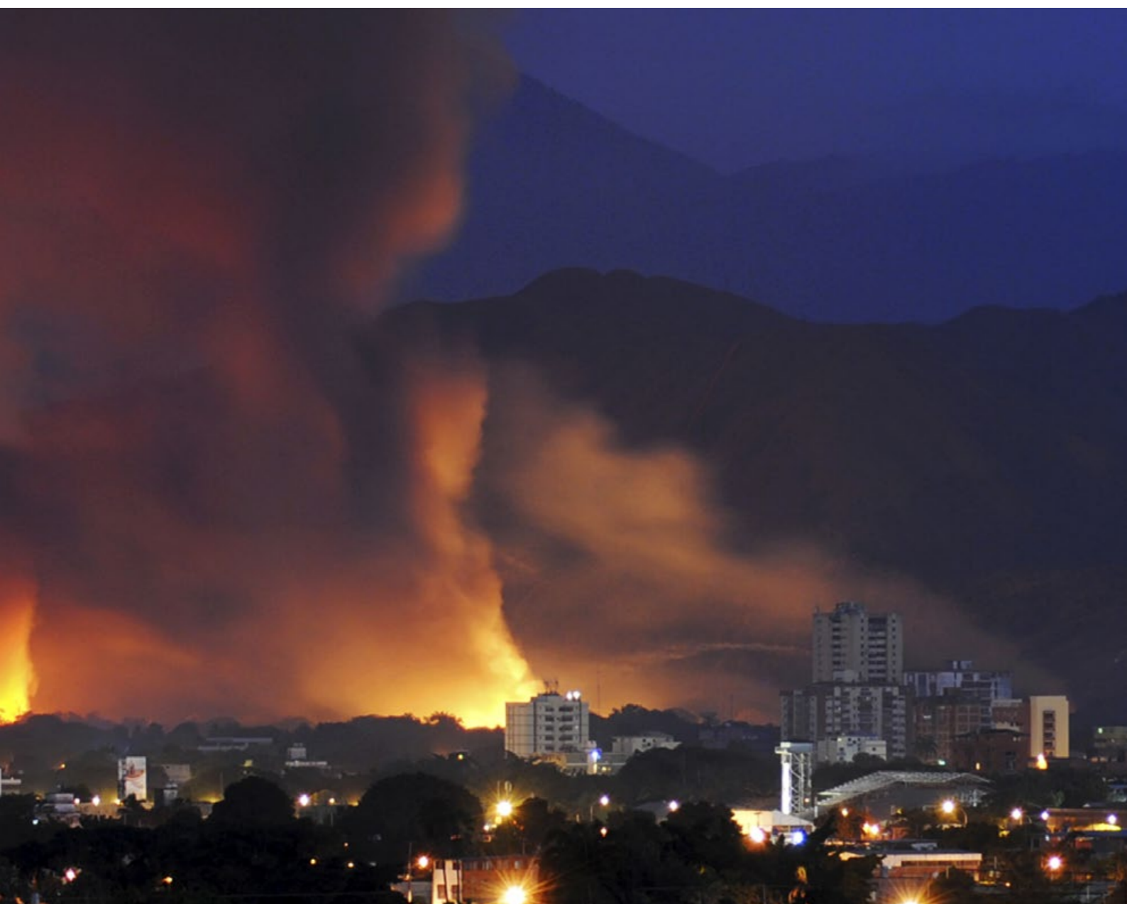
Thousands of people had to flee for their lives when a series of powerful explosions took place at a military ammunition depot in the Venezuelan city of Maracay, 30 January 2011.