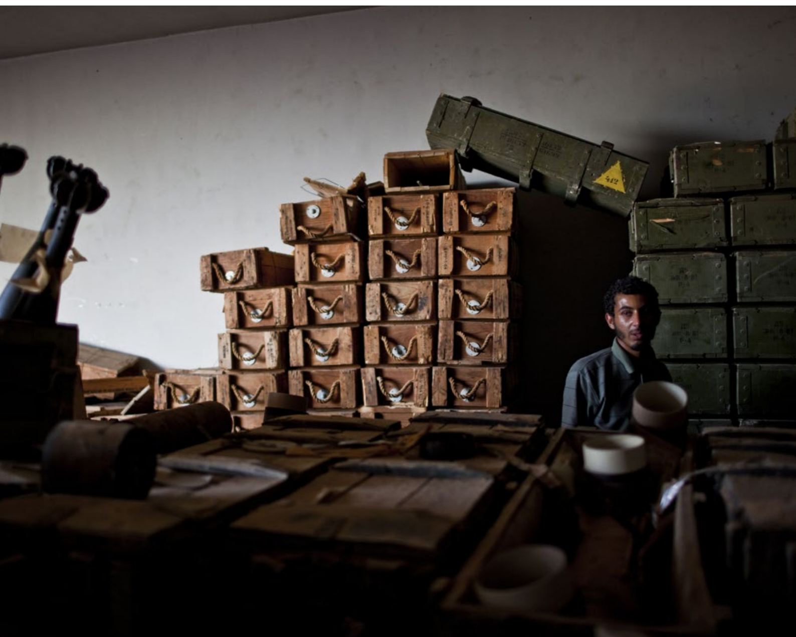
A rebel surveys ammunition in a Qaddafi government ammunition depot, outside of Zintan, Libya, 2011.