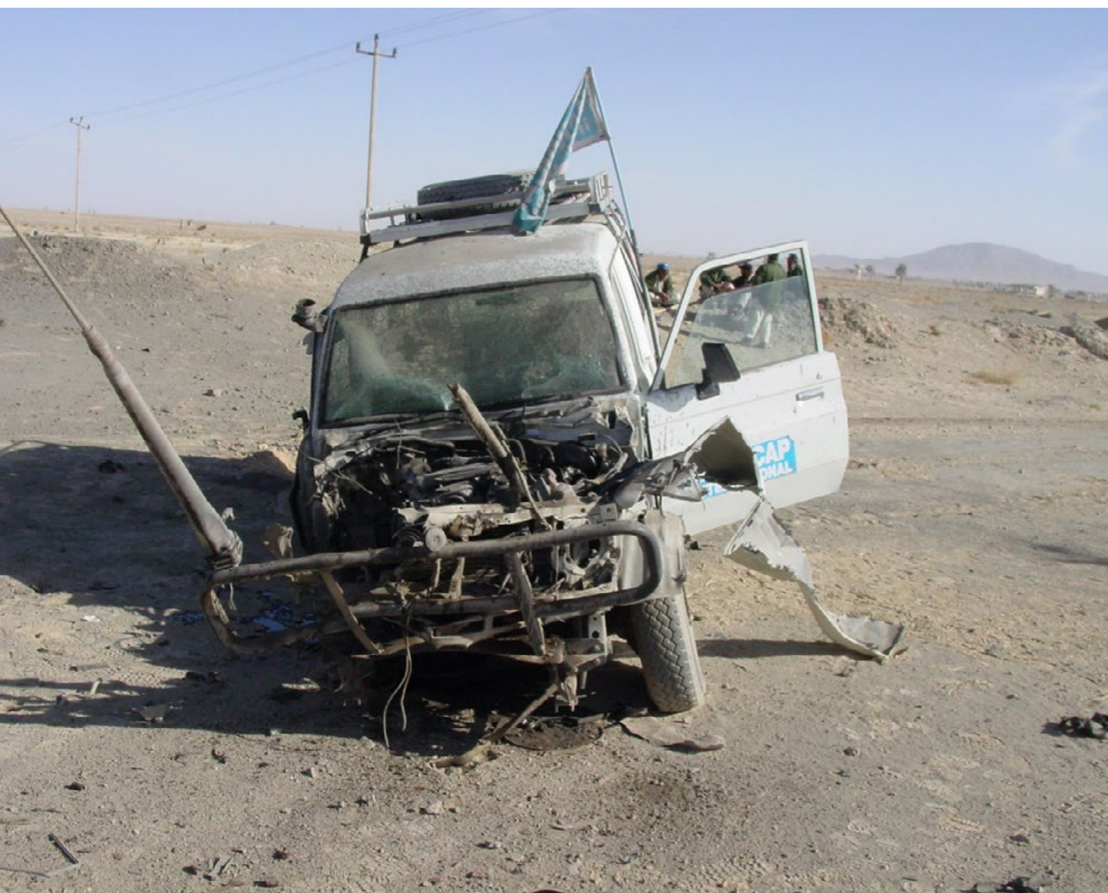
A vehicle from the organization Handicap International which was destroyed by an antivehicle mine in Afghanistan in 2003.