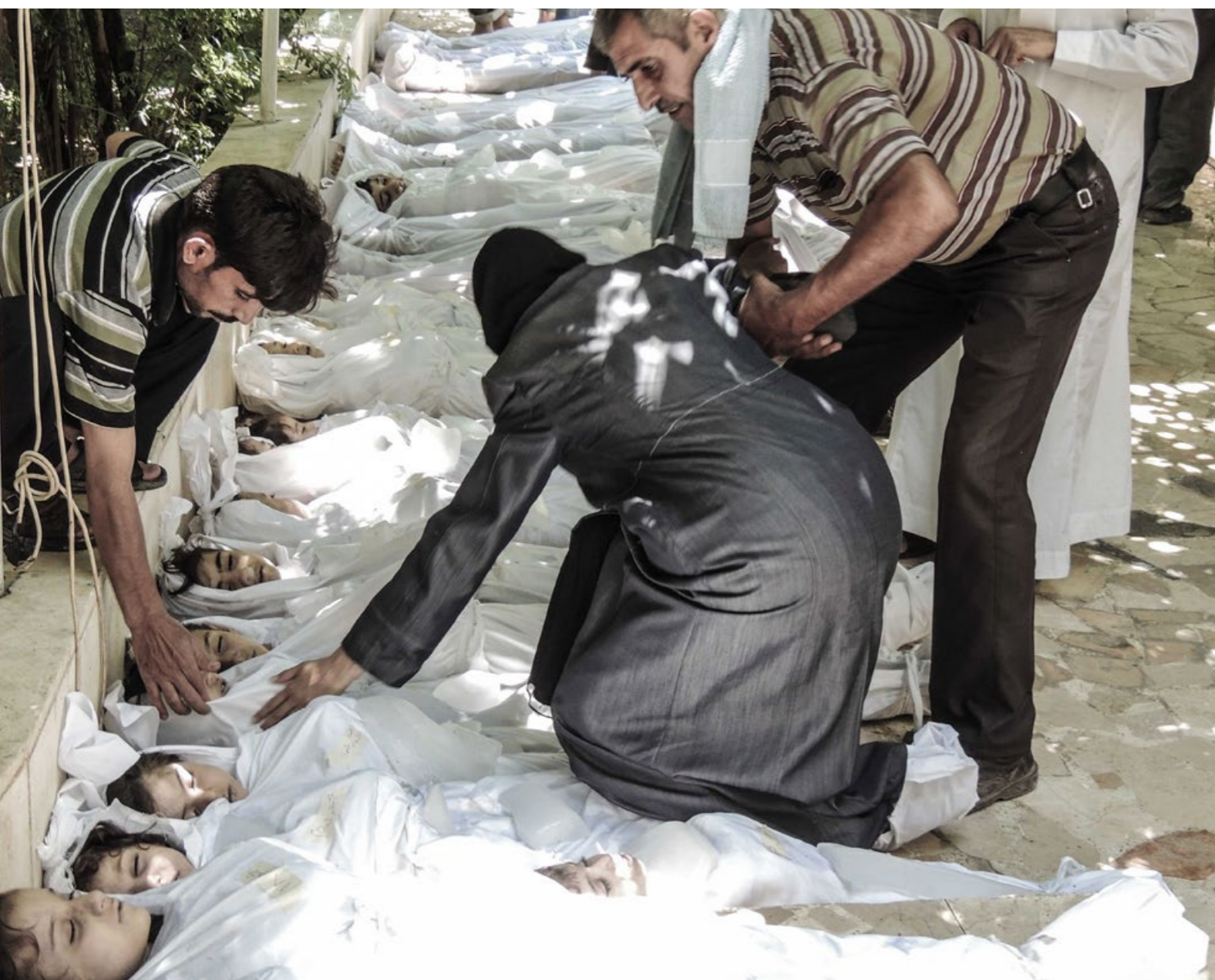
The use of chemical weapons in Syria in August 2013 killed and injured thousands, including hundreds of children.