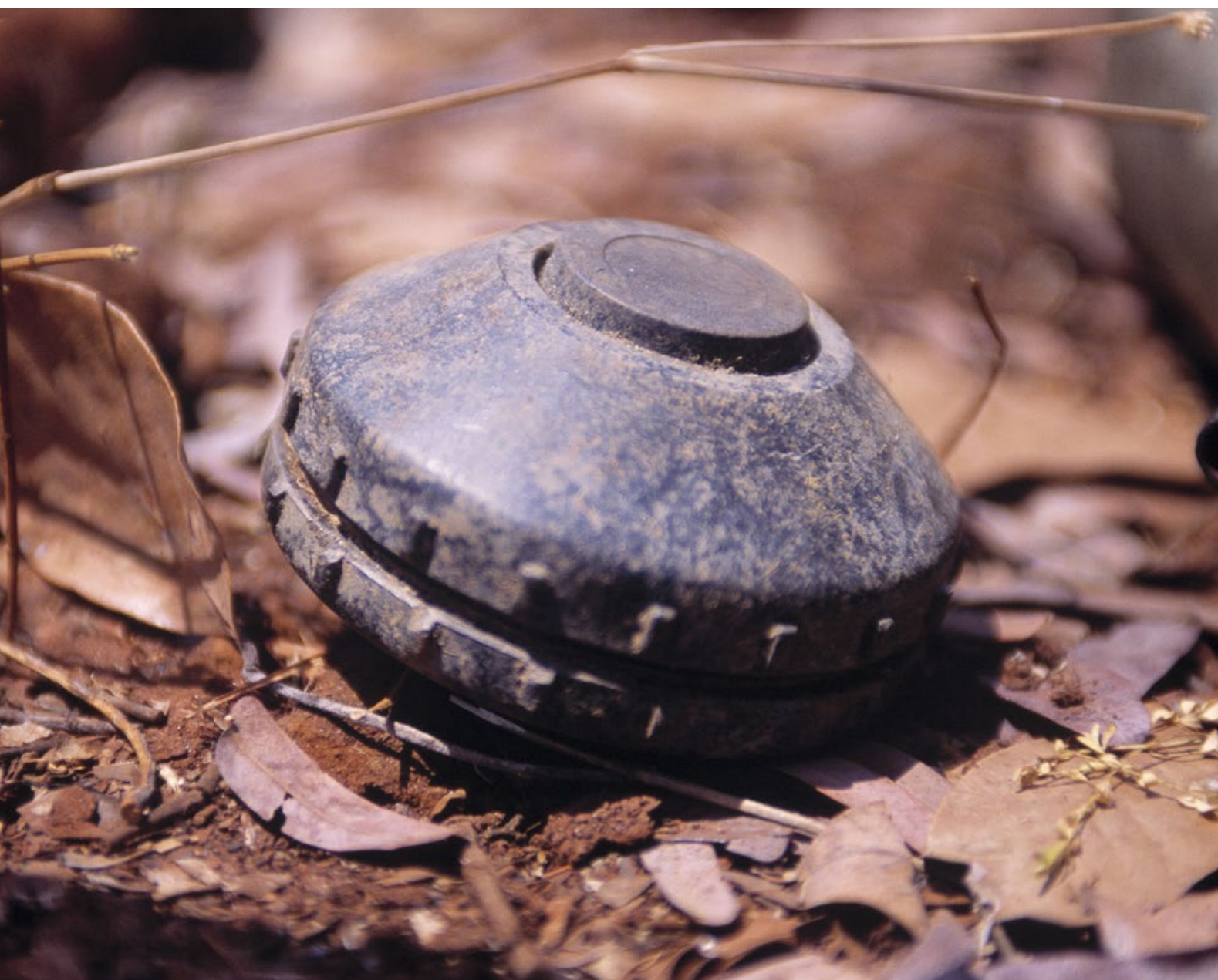
Antipersonnel mine in Angola.