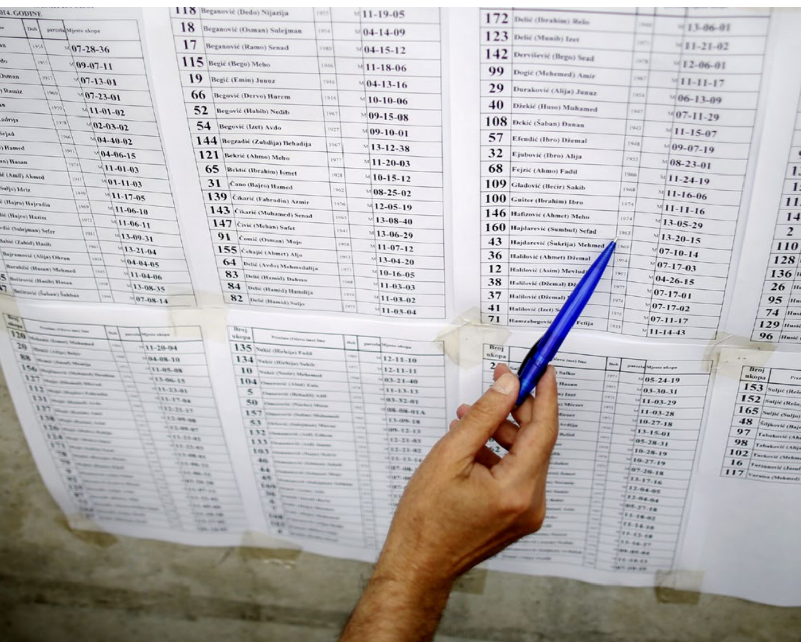
A Bosnian Muslim searches for the number of the coffin of a relative, who was one of the 175 newly identified victims from the 1995 Srebrenica massacre, in Potocari Memorial Center, near Srebrenica 10 July 2014.