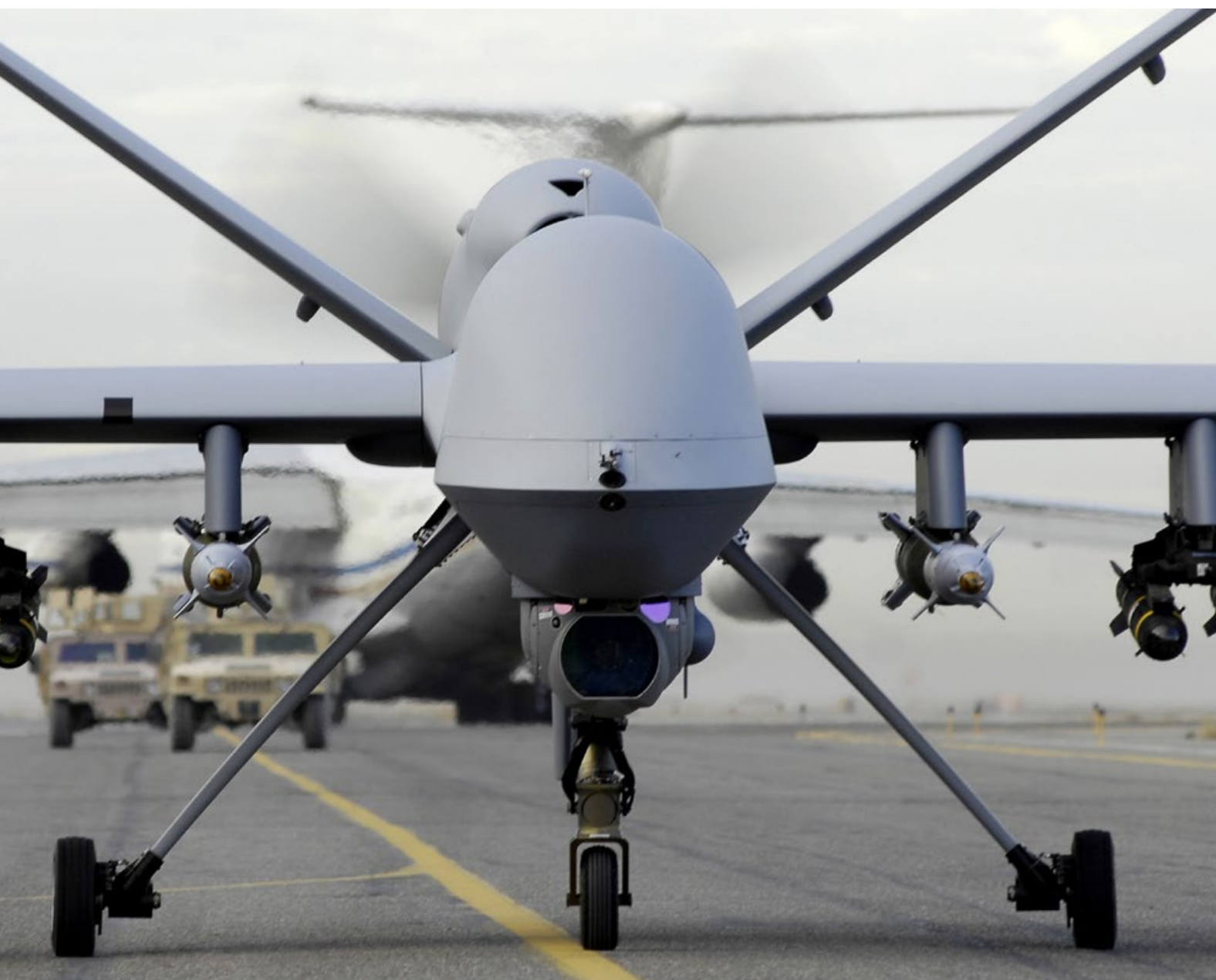
An armed MQ-9 Reaper unmanned aerial vehicle taxis down a runway in Afghanistan.