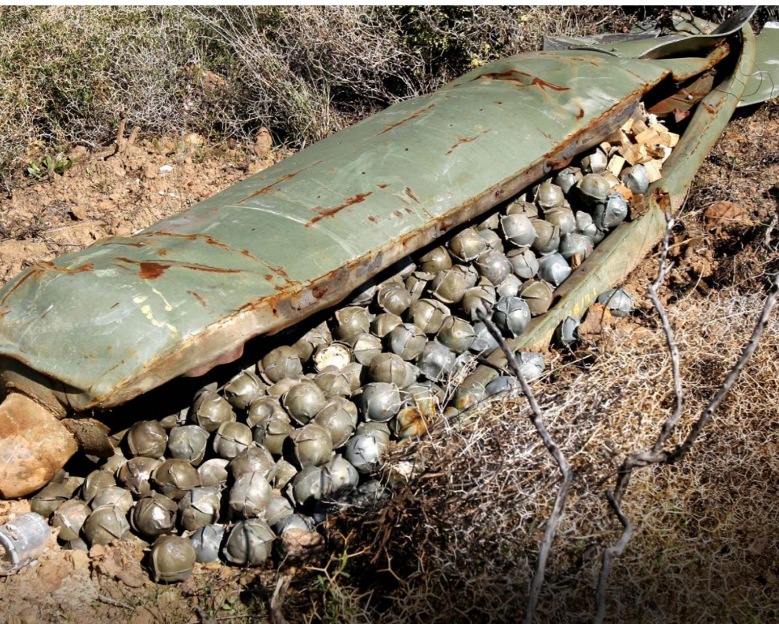
A cluster bomb unit containing more than 600 submunitions, that was dropped by Israeli warplanes during the 34-day long Hezbollah-Israeli war, sits in a field in the southern village of Ouazaiyeh, Lebanon, Thursday, 9 November 2006.