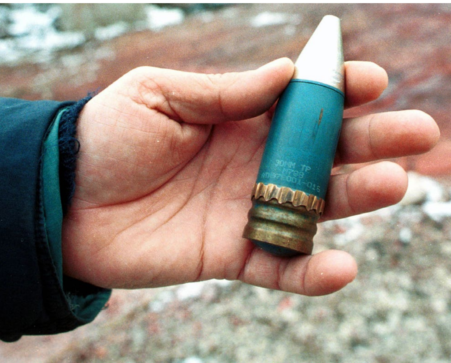
A 30mm anti-armour projectile containing depleted uranium, used by NATO during the air-strikes on Bosnia in 1995, and later found in a former military factory in the suburb of Vogosca, near Sarajevo. TRW includes, but is not limited to, depleted uranium.