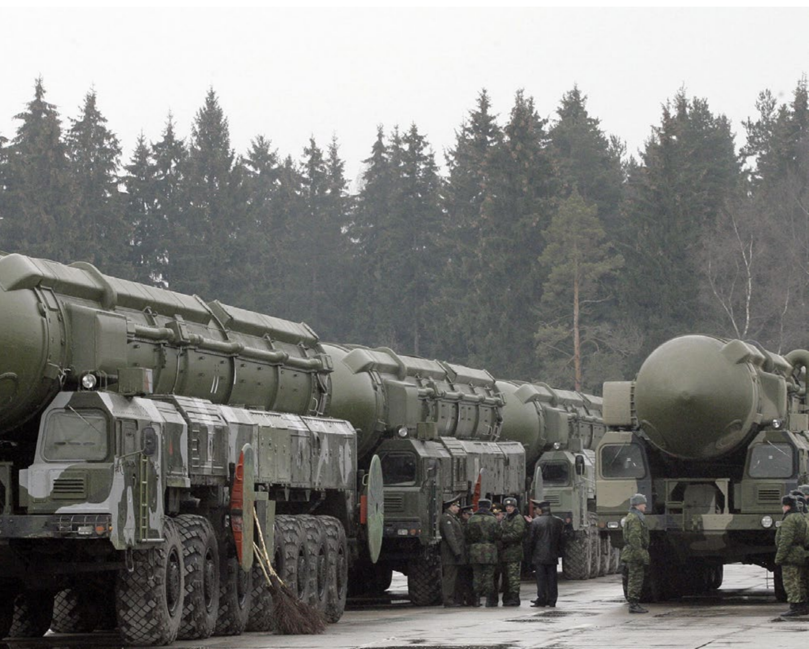
Russian nuclear Topol (aka SS-25) intercontinental ballistic missiles photographed in Yushkovo outside Moscow, 8 March 2008.