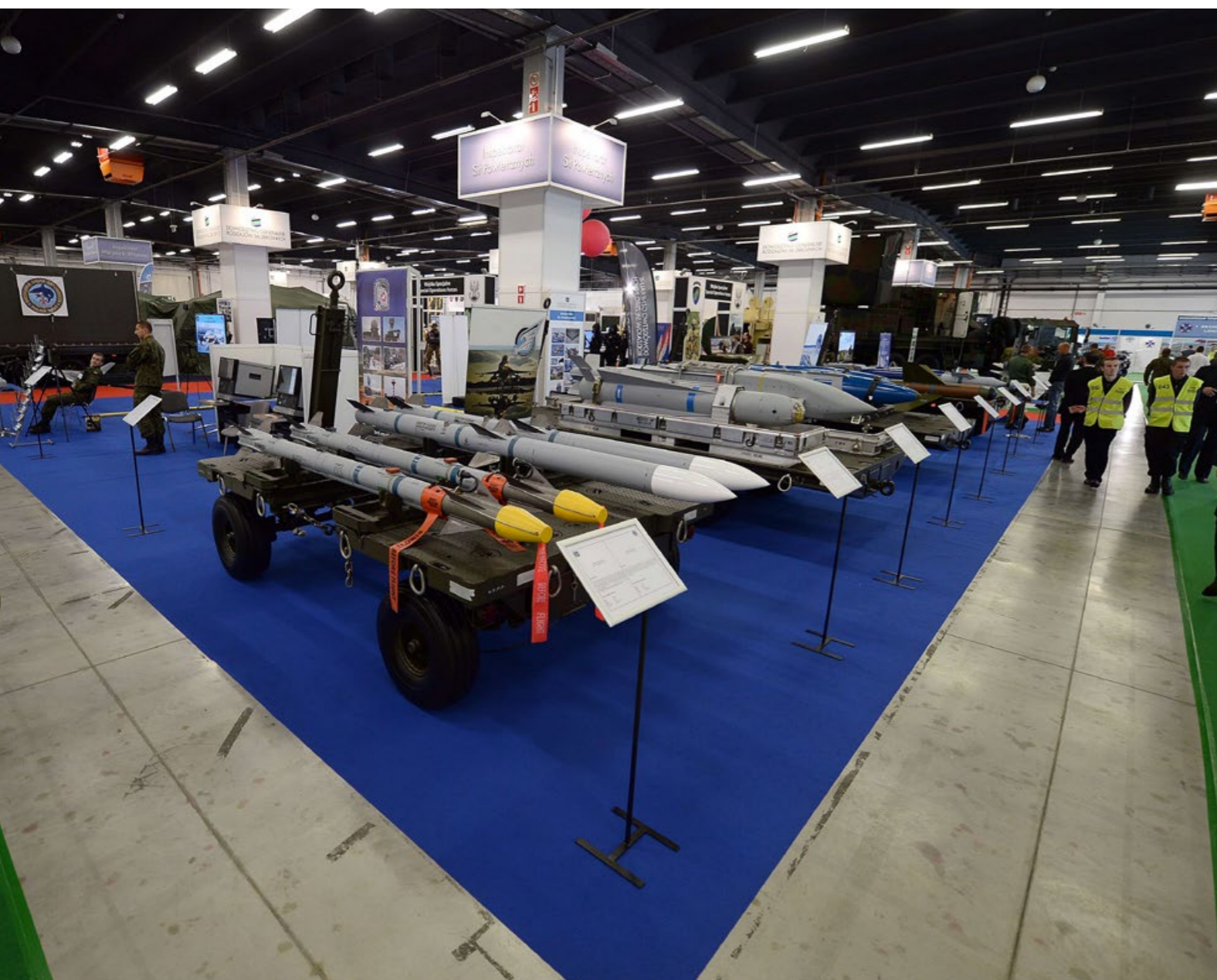
Arms manufacturers and dealers from across the globe met at a trade fair in Kielce, Poland in September 2014.